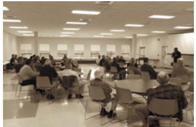
Disciples ministers converge at annual Clergy Consultation Approximately 50 ministers from the Pennsylvania region came together in early February for the annual Clergy Consultation at Antiochian Village.